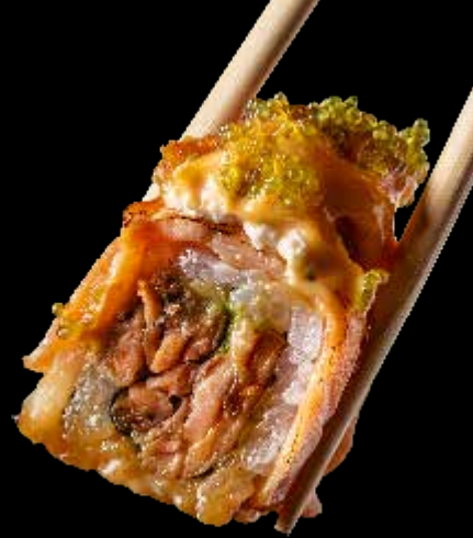
| DYNAMITE ROLL