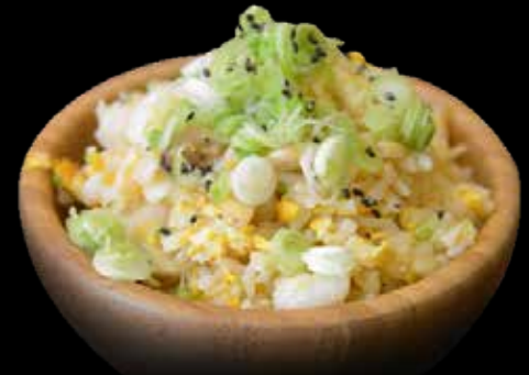
SEAFOOD FRIED RICE