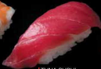
| TUNA SUSHI