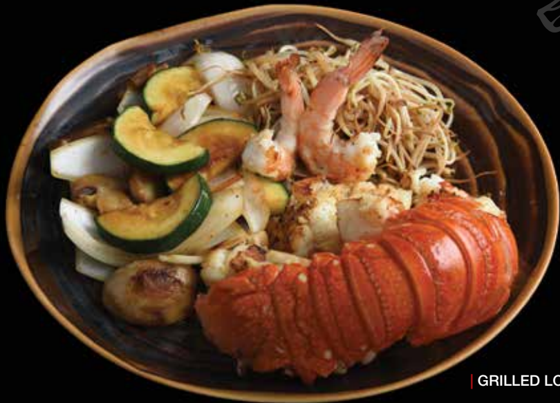
| GRILLED LOBSTER