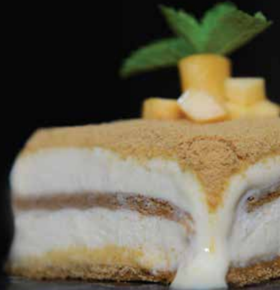
| MANGO FLOAT