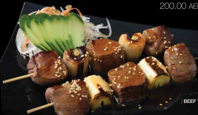
| BEEF YAKITORI