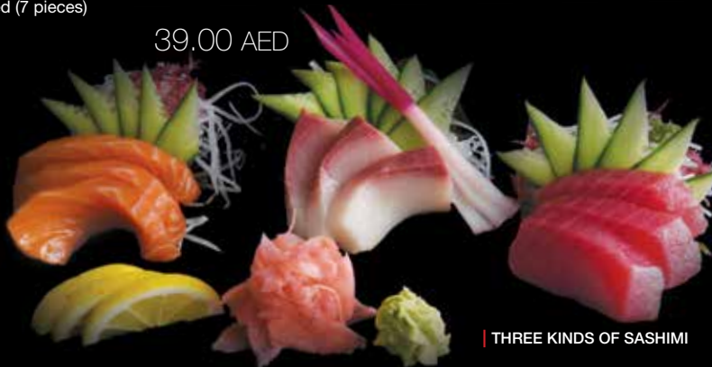
THREE KINDS OF SASHIMI