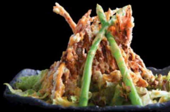
| FRIED SOFT SHELL CRAB