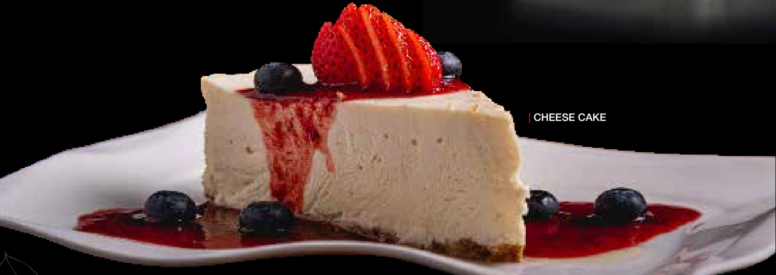
| CHEESE CAKE