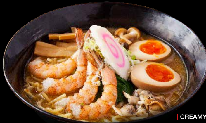
CREAMY SEA FOOD RAMEN