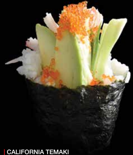
| CALIFORNIA TEMAKI