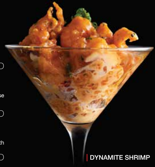
| DYNAMITE SHRIMP