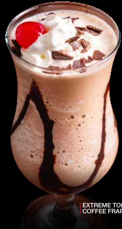
EXTREME TOFFEE COFFEE FRAPPE