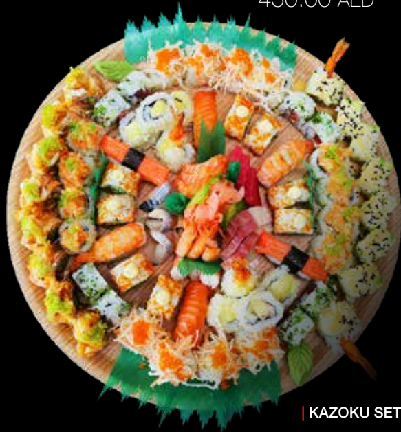
| KAZOKU SET