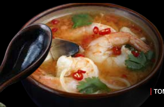
| TOM YUM SOUP