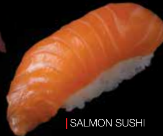
| SALMON SUSHI