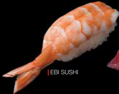
| EBI SUSHI