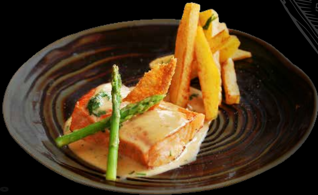
GRILLED SALMON W/ SAUCE CREAM BUTTER